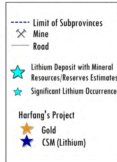
Figure 1. Location of Harfang's projects with respect to lithium deposits and significant occurrences in Eeyou Istchee James Bay. The Serpent-Radisson Property has both gold and Critical and Strategic Mineral occurrences ("CSM"). The Lemare Property is located next to the Whabouchi lithium deposit.